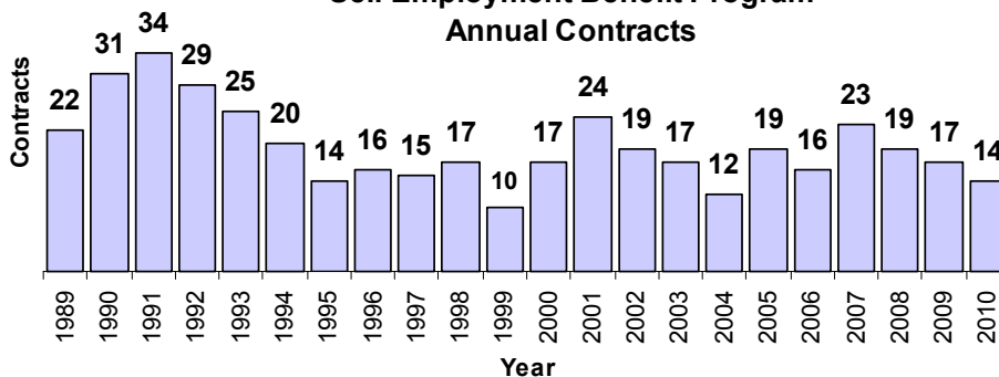
Self Employment Benefit Program Annual Contracts

Invest Kootenay is a regional initiative that started in early 2005 with a focus on pursuing local and regional economic development activities aimed at attracting out of area investment. Staff continue to participate in moving this initiative forward. For more information visit www.investkootenay.com .